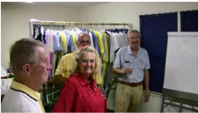
Ship's Store is open