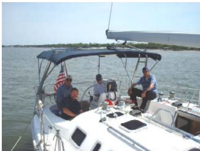
Wind Elephant Crew at the Blue Angel's Raft Up