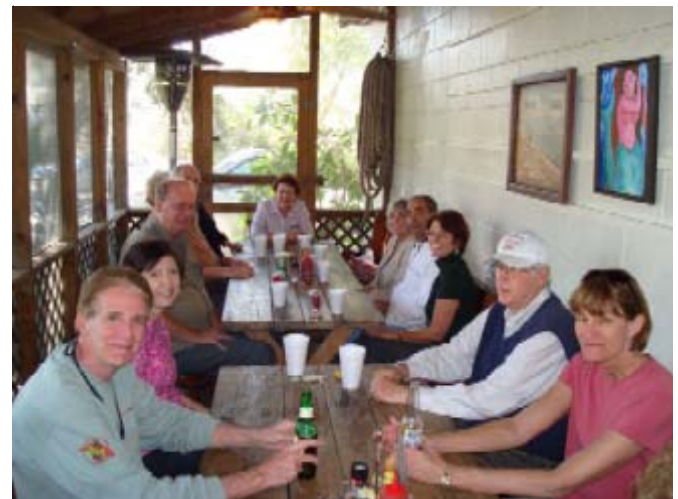
Lunch in McClellanville