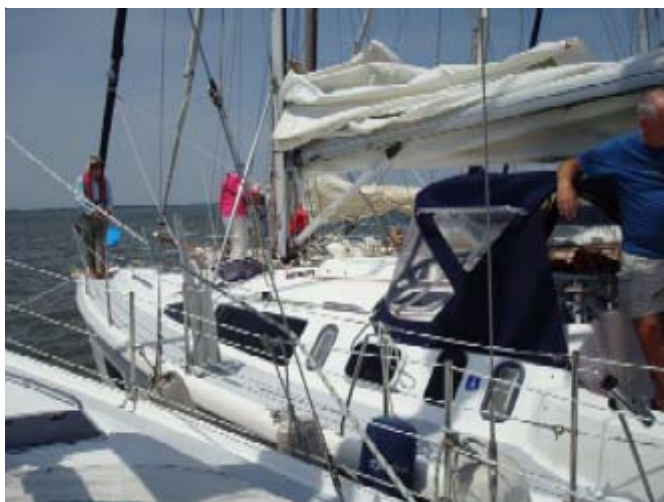
Rafting Up at the Blue Angels

The anchor boast was Mobjack (P/C Fred Wichmann) which picked up a mooring. Rafted up with Mobjack were First Light (Rob Turkewitz), Odyssey (Mike Fauss), Restless (Ken Lewis) and Wind Elephant (Cdr Harl Porter). After lunch all watched the Navy Blue Angels aero demonstration team. The Air Show was impressive and we all had front row seats.